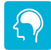
Promotion of SCP